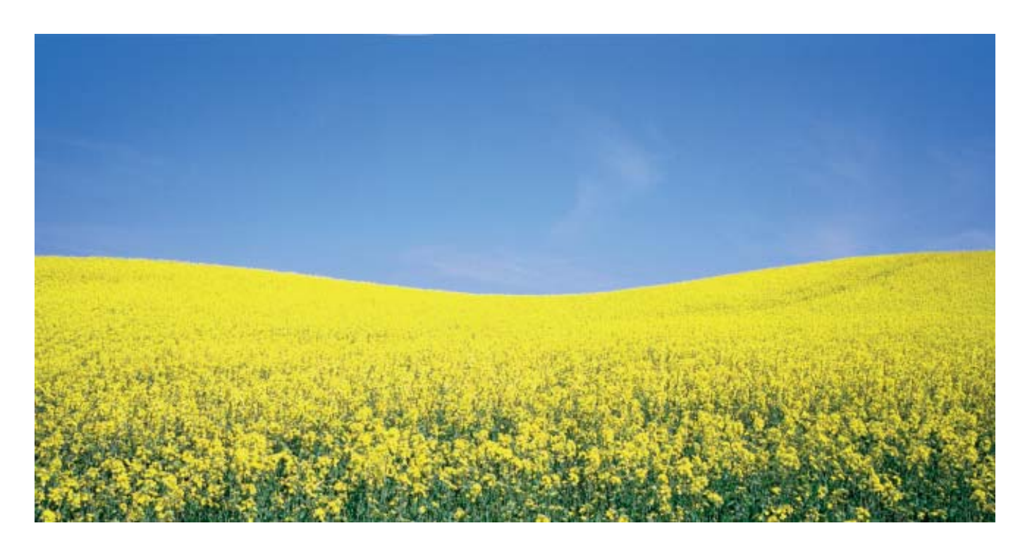
The Rural Parliament 2004